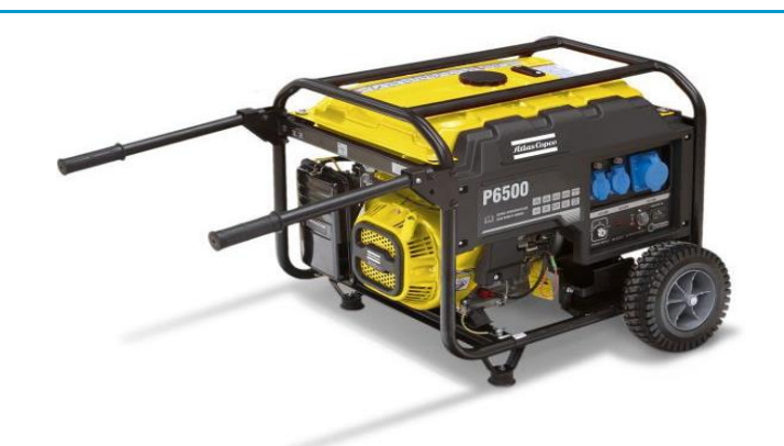
Genset Image for illustration purposes only