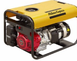
Genset image for illustration purposes only